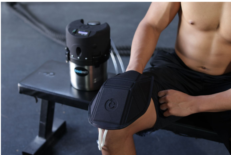
Arteria Technology's CoolMitt works to reduce muscle temperature.

Arteria Technology now sells the gloves known as CoolMitt at $1,500, marketing them to athletes looking to boost performance as well as people who work in extreme heat.