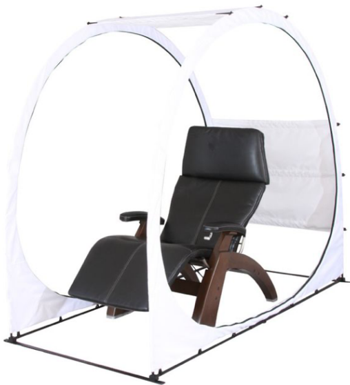
Magneceutical Health's Magnesphere Halo for PEMF therapy

Most PEMF gadgets sold for home use, like mats and chairs, start at around $1,000 and are marketed as ways to reduce inflammation or relieve pain, in conditions like arthritis. These devices have also become a staple at Upgrade Labs and Restore Hyper Wellness, two chains of centers in the U.S. that offer treatments aimed at enhancing performance. Magneceutical Health says its Magnesphere Halo, a $13,000 chair surrounded by large copper coils that create a uniform magnetic field around the body, can help reduce stress by resetting the nervous system.